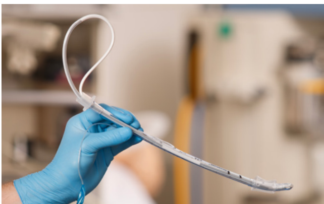
Straight to cuff.