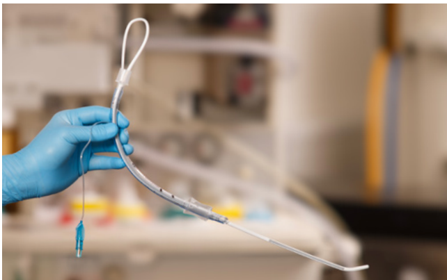
The Tracheal Tube can be pre-loaded over the USB so the tip of the tube is located at the point where the second malleable section begins (identified by the grey sections). The proximal end is then folded back over into the Tracheal Tube so the tube does not move accidentally. Once the bougie has been correctly positioned, the Tracheal Tube is railroaded over the USB as normal.