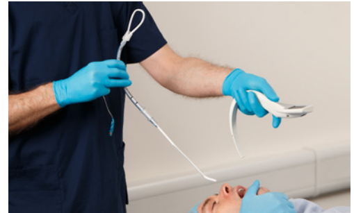
Using the USB as a bougie