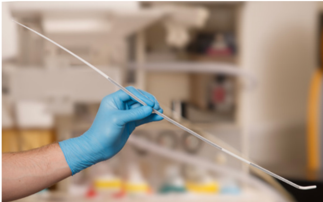
As a standard bougie.