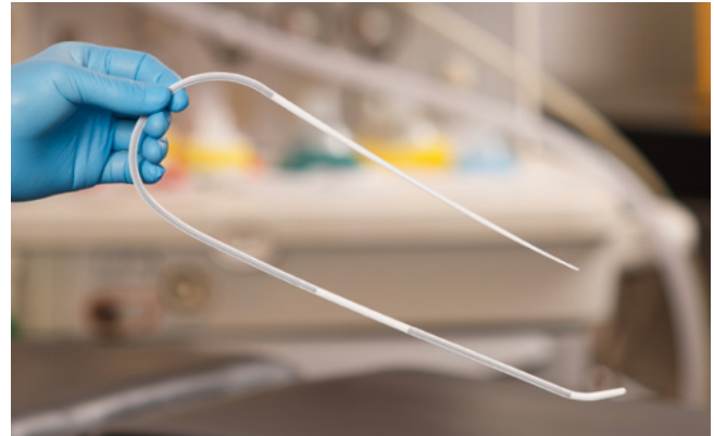
As a standard bougie, but with the USB retained in its original shape. The user can insert the device whilst still in this shape to retain directionality, then railroad the tube over the USB once correctly positioned.