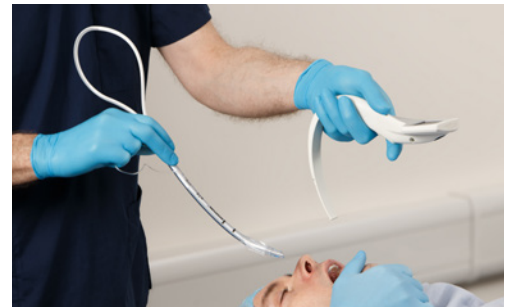
Using the USB as a stylet