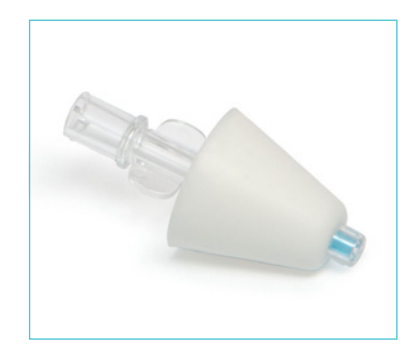
Airway Management • Atomisation Devices